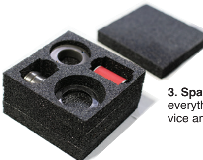
3. Spare-parts kits include everything you need to service and repair your valve