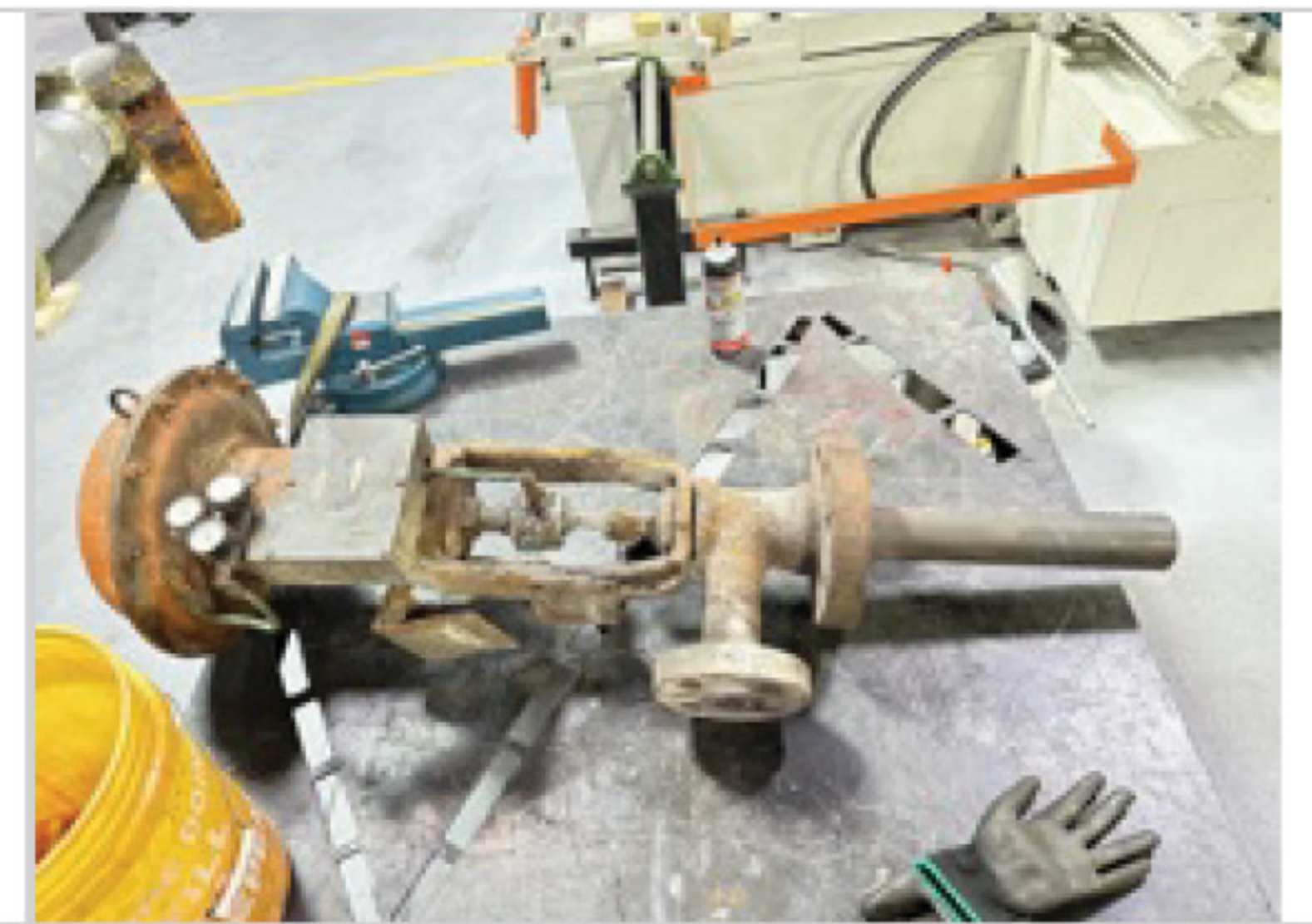
As Found Part