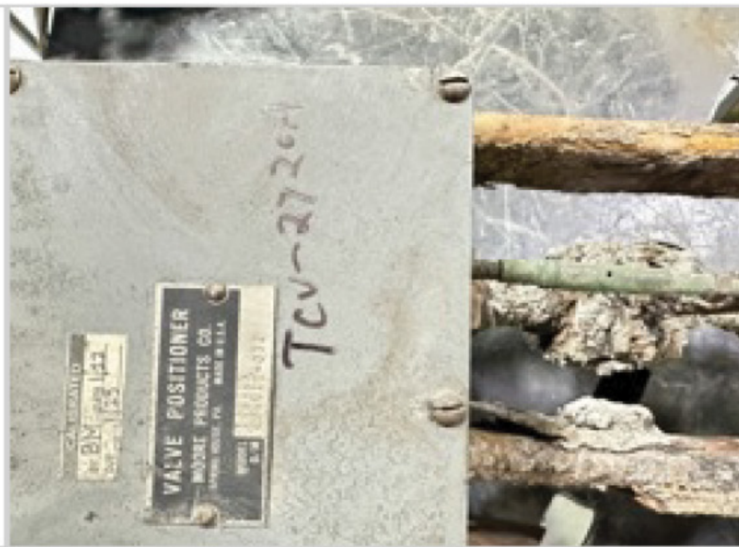
As Found Part