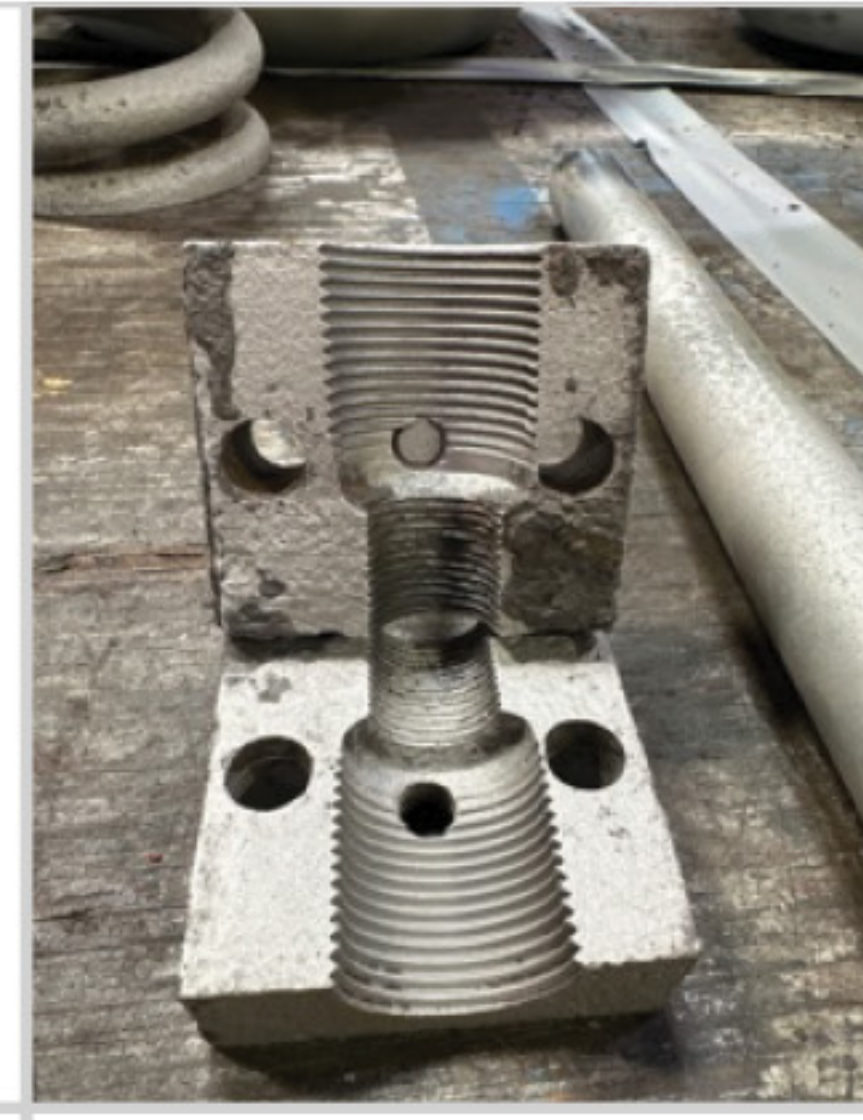
As Found Part