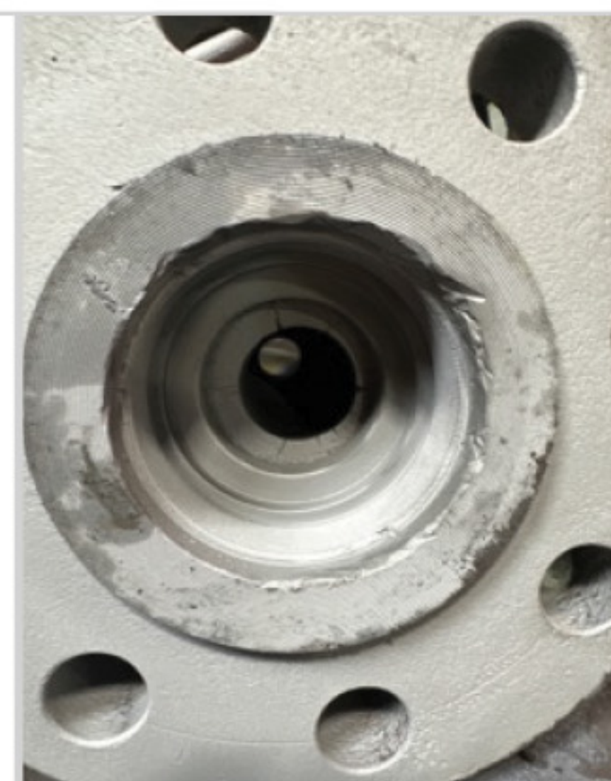
As Found Part