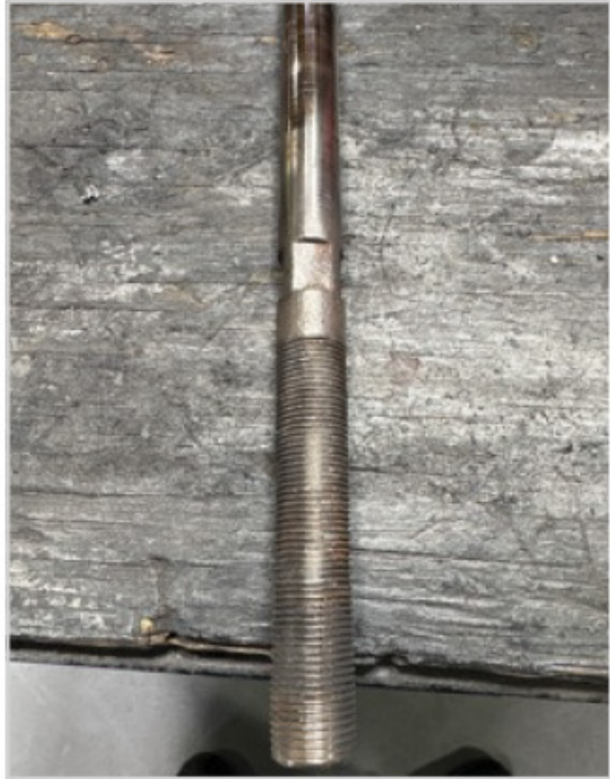
As Found Part