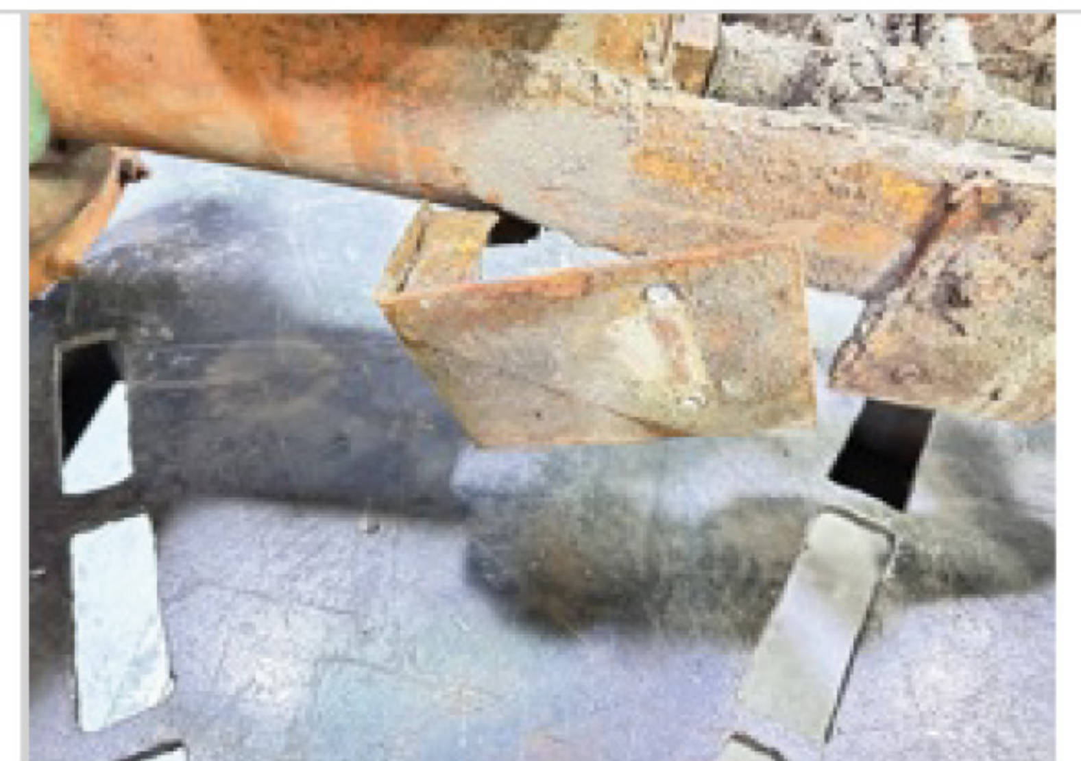
As Found Part