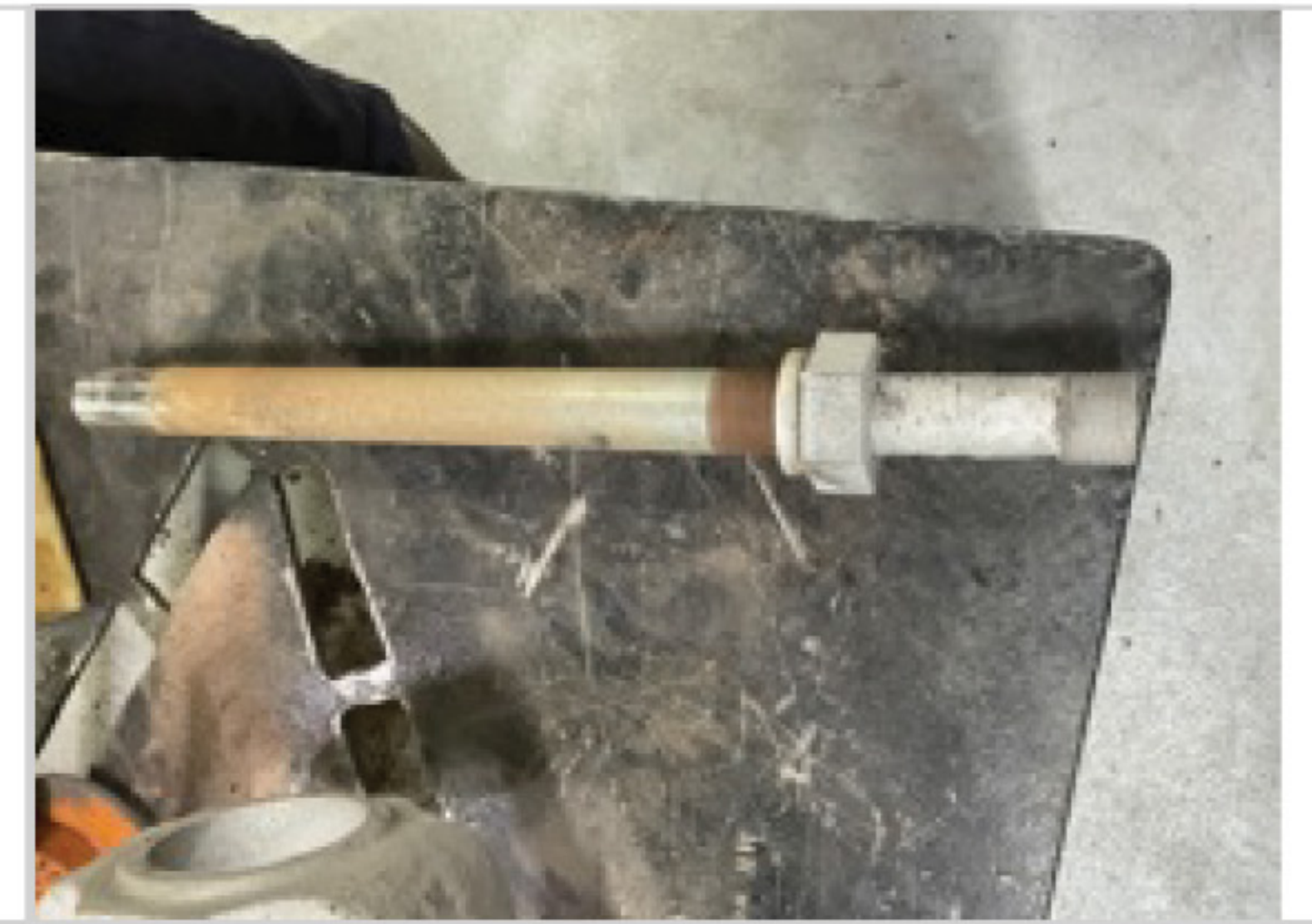
As Found Part