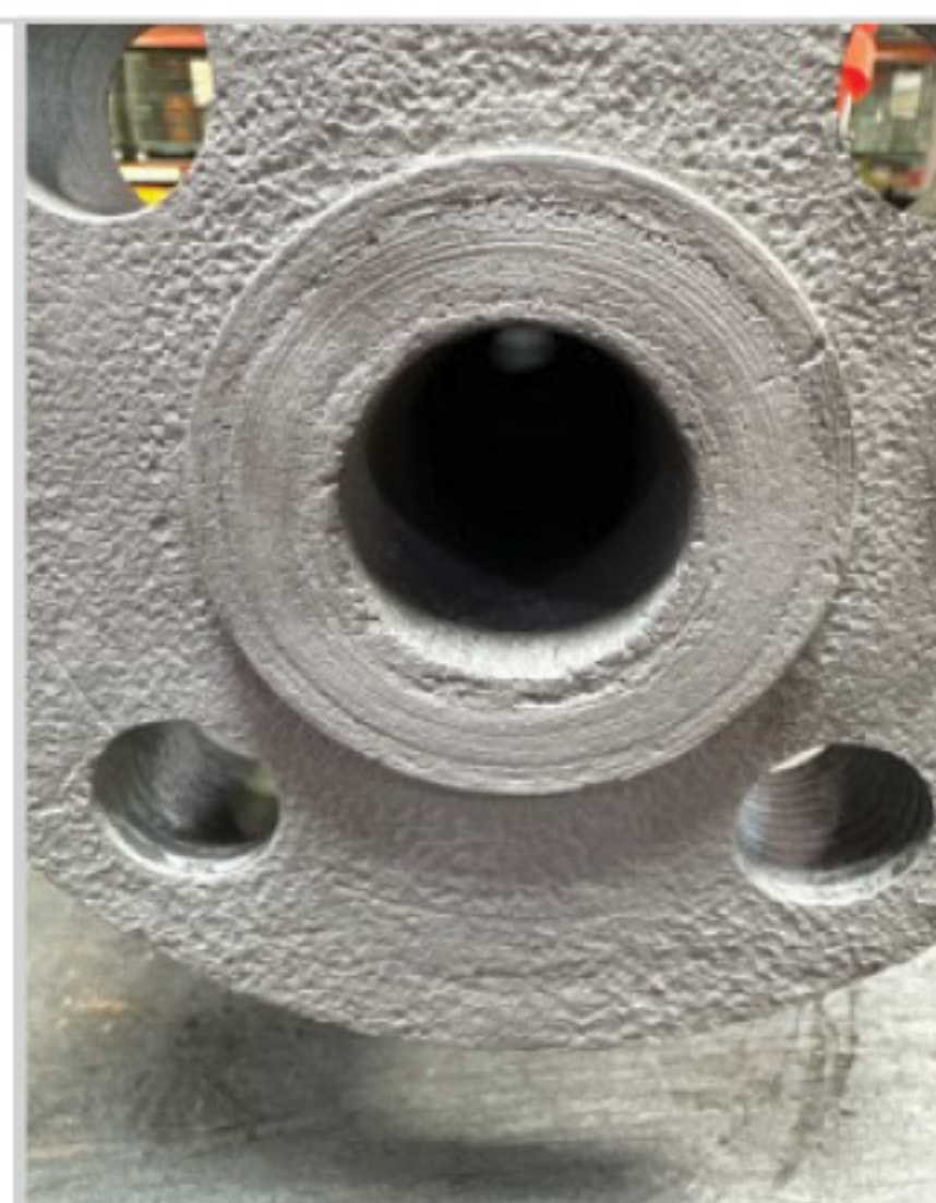
As Found Part