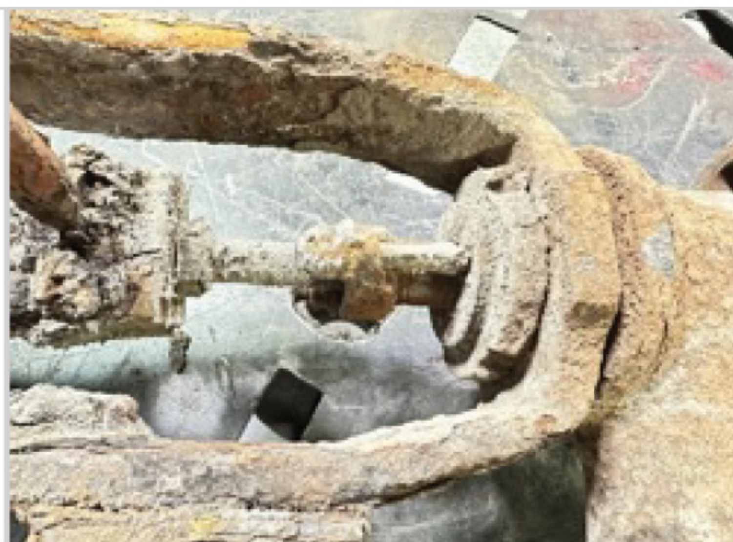
As Found Part