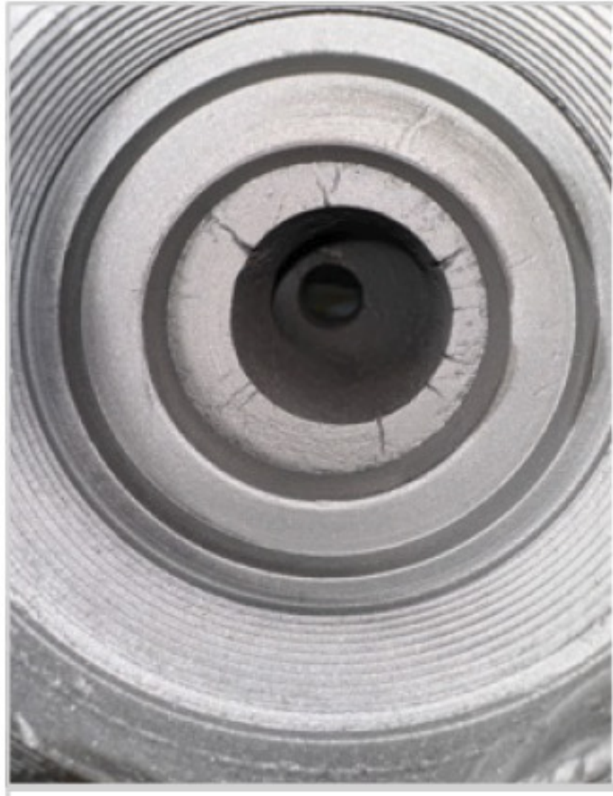
As Found Part