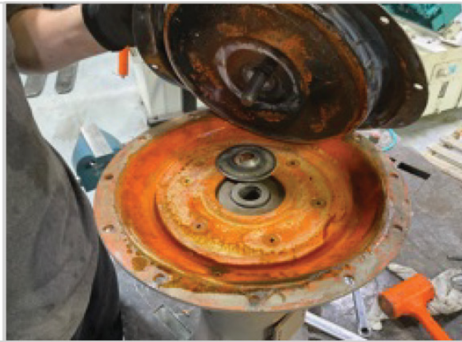
As Found Part