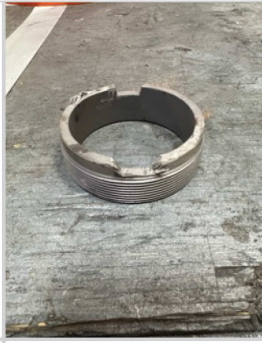
As Found Part