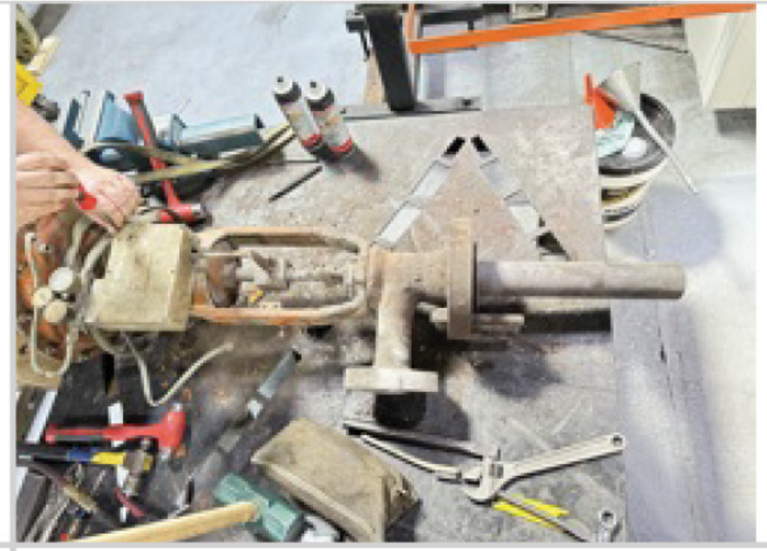
As Found Part