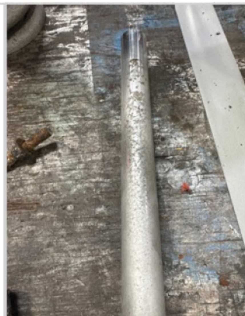
As Found Part