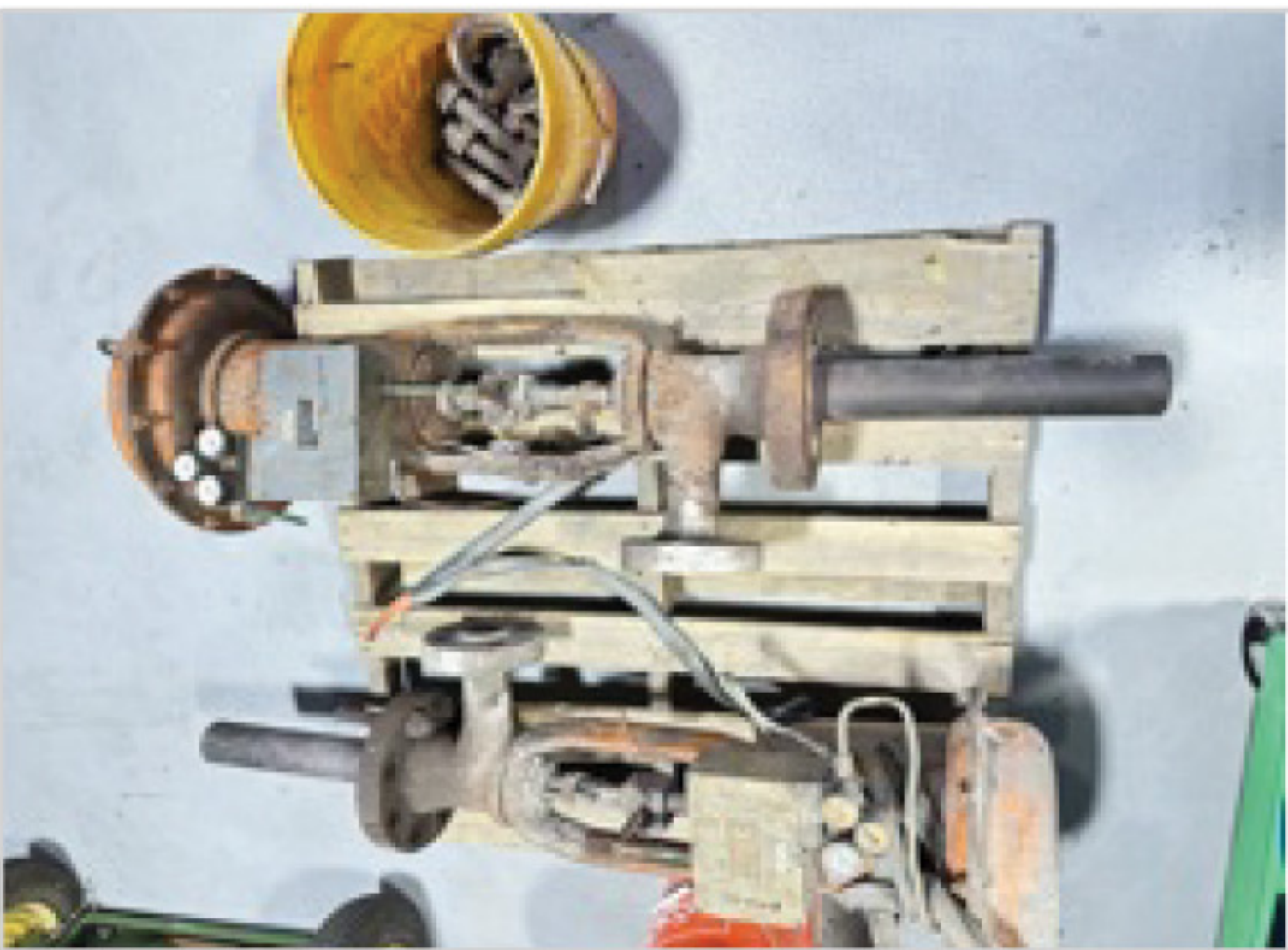
As Found Part