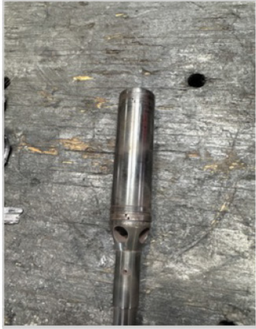
As Found Part