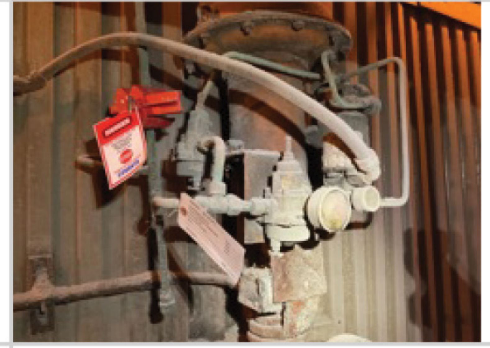
As Found Assembly