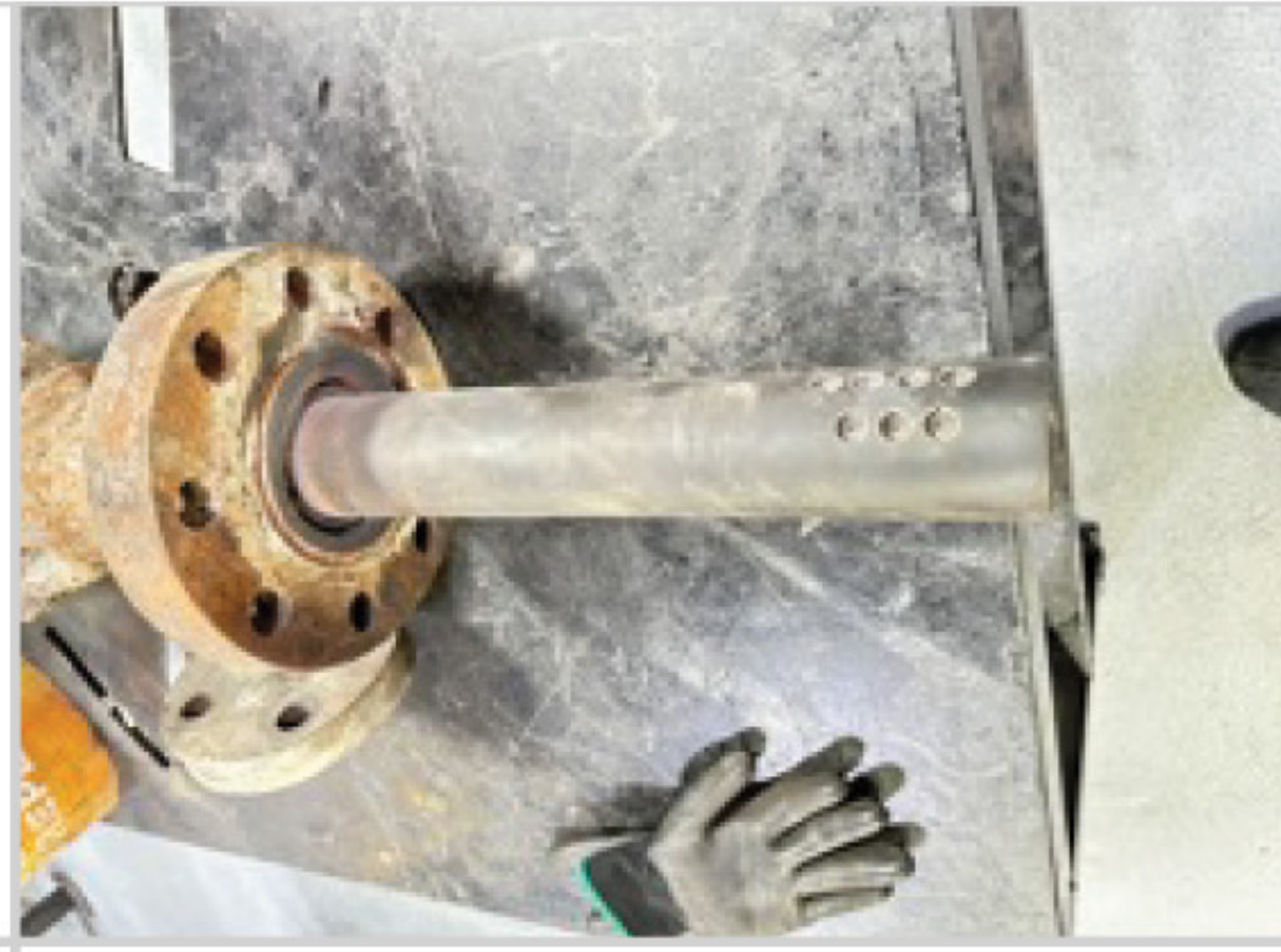
As Found Part