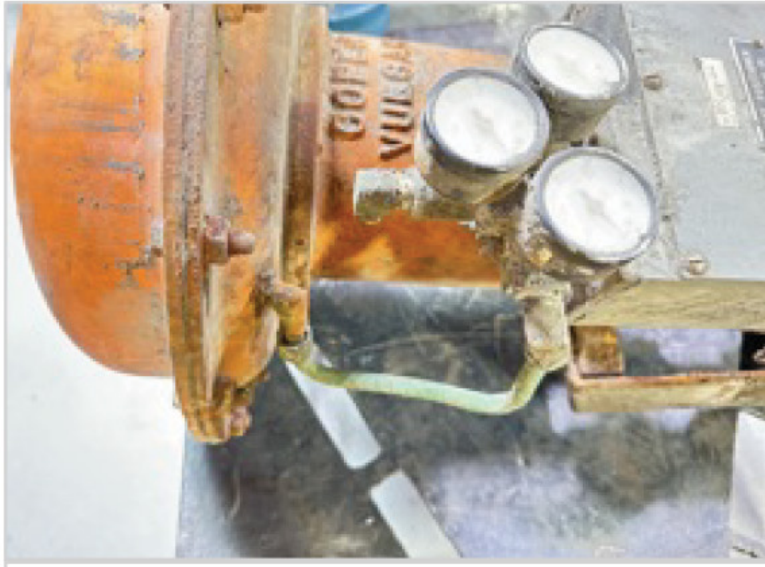
As Found Part