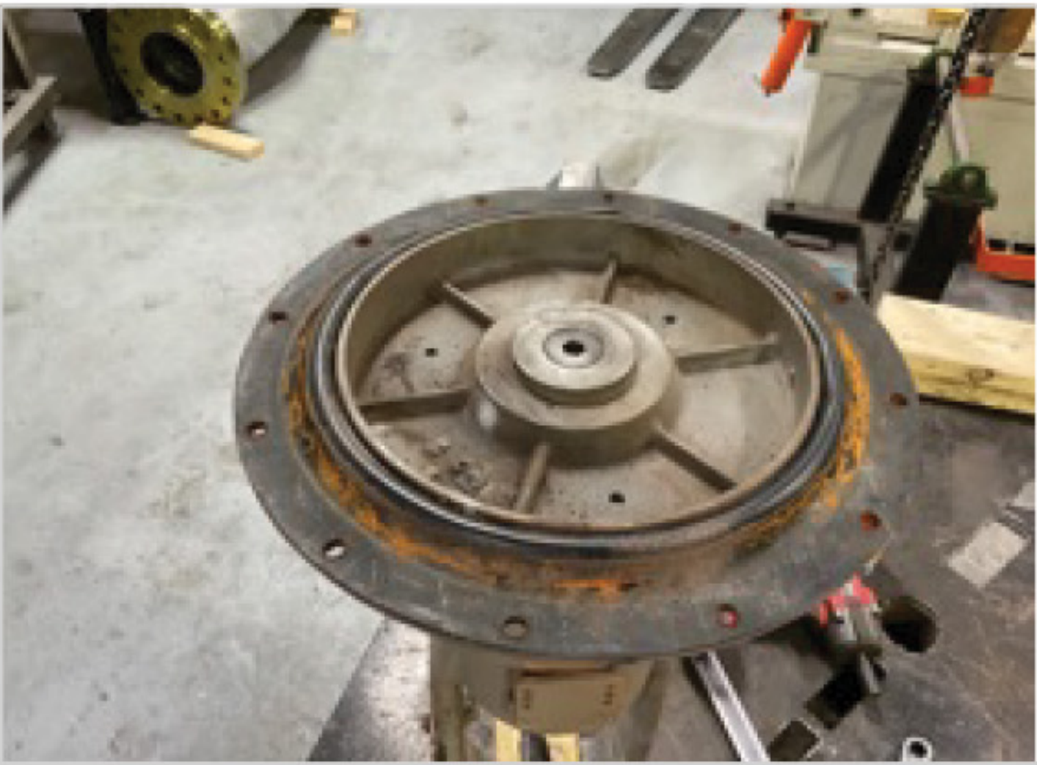
As Found Part