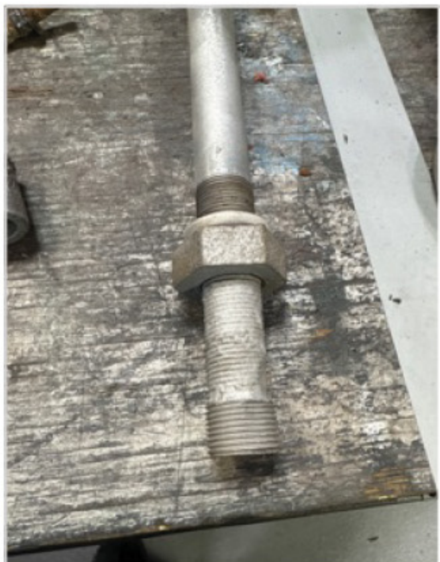
As Found Part