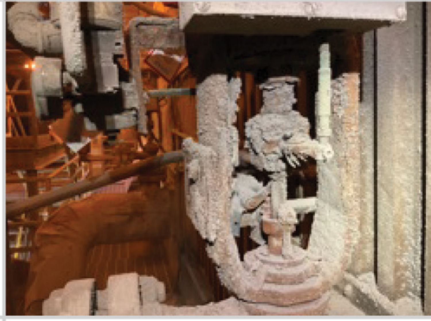
As Found Assembly